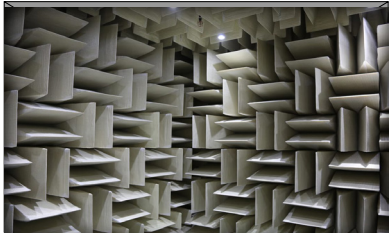
The inside view of the chamber of silence

World's 'quietest room' is located at Microsoft Headquarters in the Washington state which is known as 'anechoic' chamber. It is of six concrete layers each having 12 inches thickness, that allows to block sound from outside world. You can hear your heartbeat if you stand in it for long enough. This is also called 'chamber of silence'. No one is able to spend more than 45 minutes in the room.