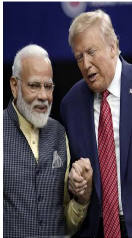
Modi & Trump during "Howdy Modi"

The US president Donald Trump's visit to India next week is a much sought after trip. In this 2 day visit he will be attending a "howdy modi" type event in Ahmedabad named "Namaste Trump". This is not the reason why people are so excited about ; the main reason of attraction is the stadium in which this event is going to be held. The stadium is the largest cricket stadium in the world and the 2nd largest stadium in the world with the sitting capacity of 1 lakh 10 thousand people. The stadium