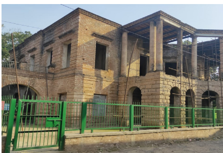
The house of Warren Hastings

Warren Hastings was the first Governor of East India Company. Have you ever visited his house, which is in Barasat? If not, then come with me. I would try to take you around his house through my words. Warren Hastings used to live there for a certain amount of time. This used to be his country house. Later it was used as a S.D.O. office. Now it is used as residence of government officials. There is no exact information about government's future plans on the house. The house is carrying a rich history. It's bricks have become weak. Recently the Archaeological Survey of India(ASI) has partially restored the house. But due to its unstable condition nobody is allowed to enter the house. But here you can recall the memories of our colonial era.